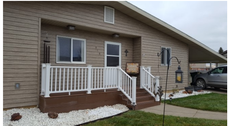
Stability of the heart is a deeper stability.

Neither one of us has ever purchased a home before so it was a big learning curve! One that we feel so blessed to be able to do. God is good!