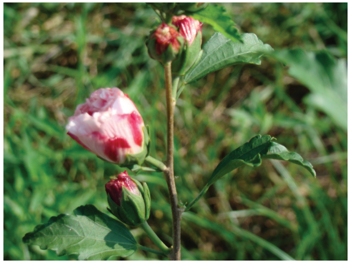
Lady Bug® has better manners compared to other altheas. Lady Bug® is a new semi-dwarf cultivar that grows slowly in a dense broadly-upright form and after

Althea, rose-of-sharon is another plant native to China that does well over a wide range of North America in zones 5-9. There are hundreds of cultivars of althea, and most become tall, brushy plants with foliage that yellows in summer and fall, and many produce lots of short lived flowers with viable seeds and become weedy.