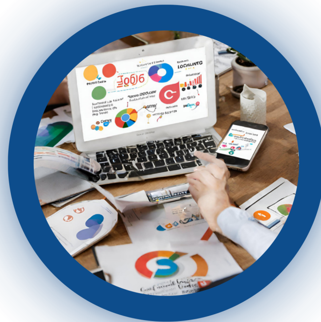
Digital Marketing/AI Strategy Automation