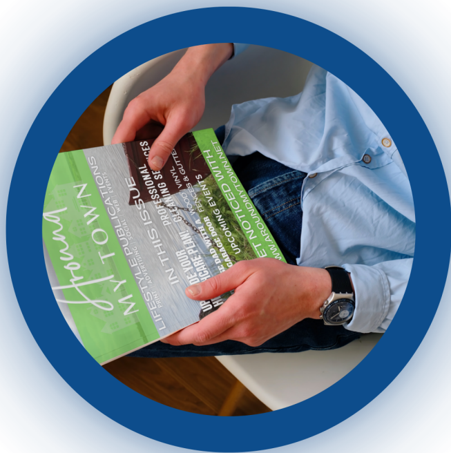
Local Advertising Local SEO

Clients of Around My Town see an average 35% increase in local engagement within just 3-6 months of partnership.