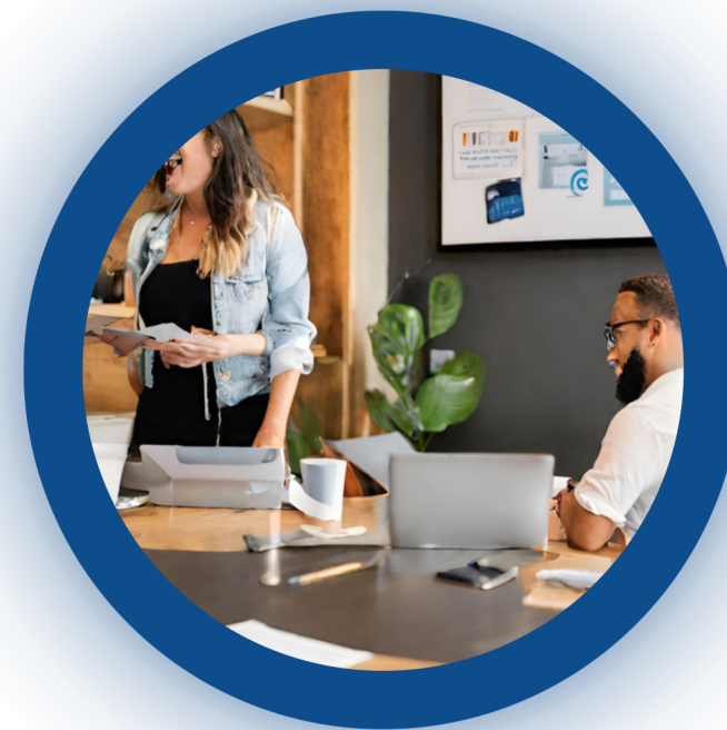
Social Media Content Creation