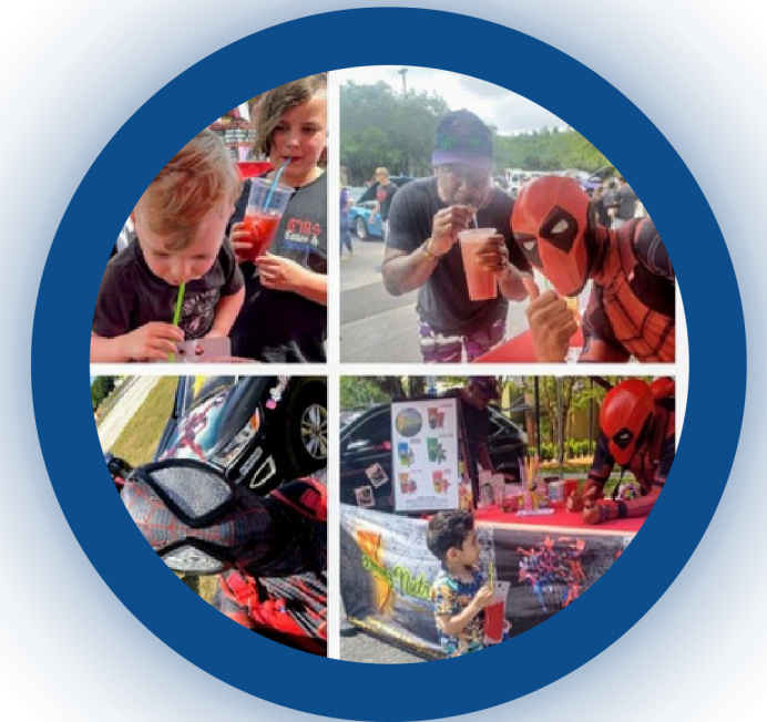
Community Outreach Engagement

Around My Town – Your Local Marketing Hub Let's Grow Together