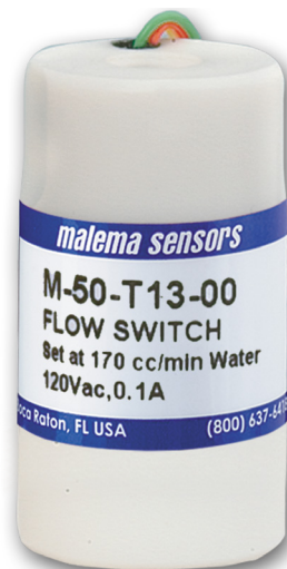
M-50 in PTFE