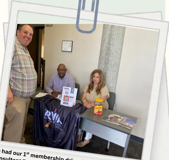
We had our 1 st membership drive during the GDOT Annual Consultant Training in the City of Forsyth, GA on April 1st Thank you GDOT for the opportunity and welcome to our new members!!