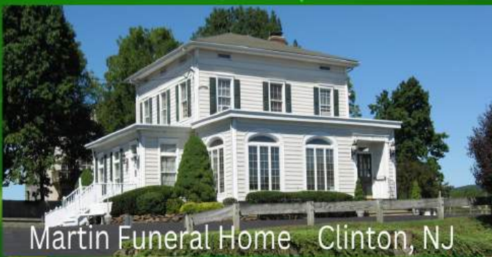
Martin Funeral Home Clinton, NJ