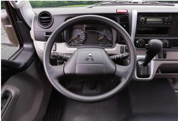
An infinitely adjustable steering wheel and dash-mounted shifter give drivers more control, while instruments and displays are always within easy reach or view. By moving the shifter off the floor, we create more leg room and easier access for passengers.