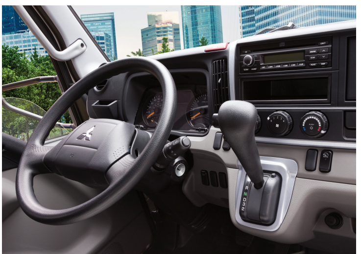
Maintain a comfortable cab environment with a standard air-conditioning system. Superior insulation preserves heating and cooling, and helps keep road noise from reaching the cab interior.