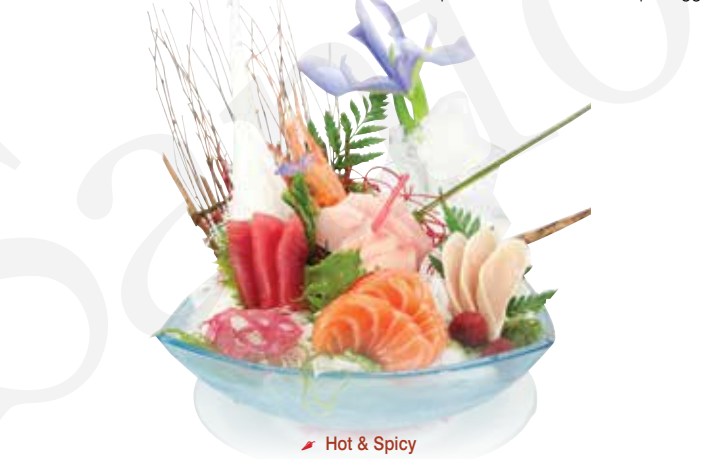
Hot & Spicy