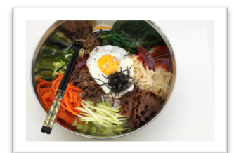
COLD BULGOGI BIBIMBAP

RICE, CARROT, SQUASH, BEAN SPROUT, CUCUMBER, WATERCRESS, FRIED EGG, BEEF BULGOGI, AND SEAWEED $10.99