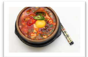
SPICY TOFU SOUP