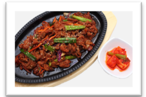
SPICY PORK BULGOGI