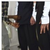
Orchestral Garments fitting