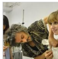
Orchestral Garments fitting