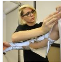
Orchestral Garments fitting