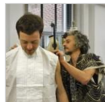
Orchestral Garments fitting