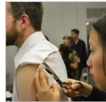
Orchestral Garments fitting