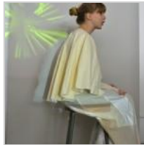
Orchestral Garments fitting