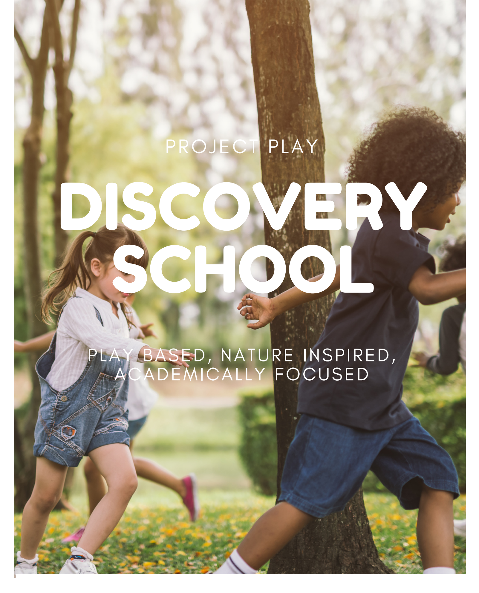
112 W Harwood Rd Hurst, TX 76054