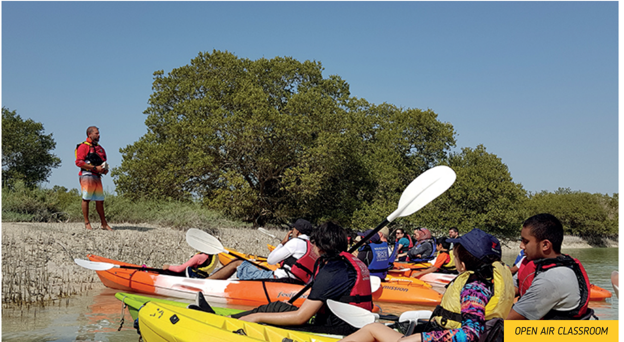
OPEN AIR CLASSROOM

A few weeks ago, a bunch of homeschoolers went kayaking in the mangroves. It was fun! If your kid is small, it may be tiring. But the good thing is they only give two person kayaks, but if there is an odd number of people that may be a problem.