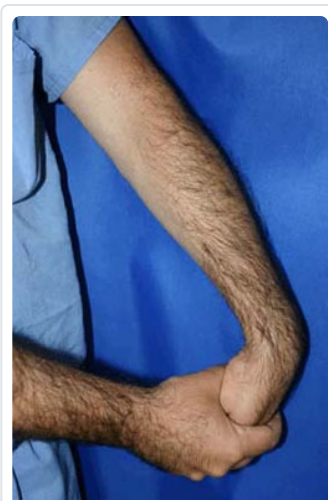
Wrist stretching exercise with elbow extended.

Physical therapy. Specific exercises are helpful for strengthening the muscles of the forearm. Your therapist may also perform ultrasound, ice massage, or muscle-stimulating techniques to improve muscle healing.