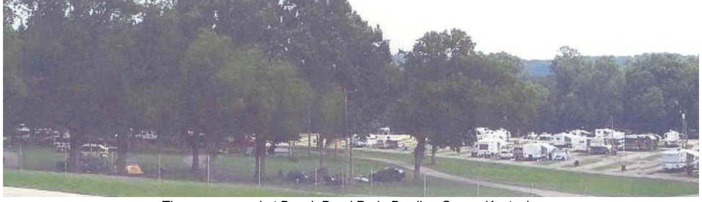
The campground at Beech Bend Park, Bowling Green, Kentucky

The Monaco Come Home Rally will be held in Orlando, FL, on October 25-27, 2005. It is only a couple of days drive from Bowling Green to Orlando. Consider the Monaco America rally as a pre-rally for the Come Home Rally. Come to Bowling Green and then join many of the Monaco America members as they travel on down to Orlando for the Come Home Rally.