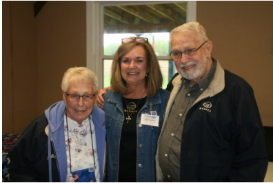
Old Timers (figuratively speaking)