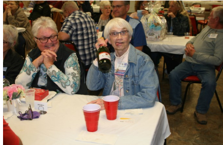
Enjoying after dinner Raffle