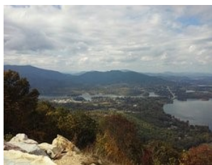
View from Bell Mountain