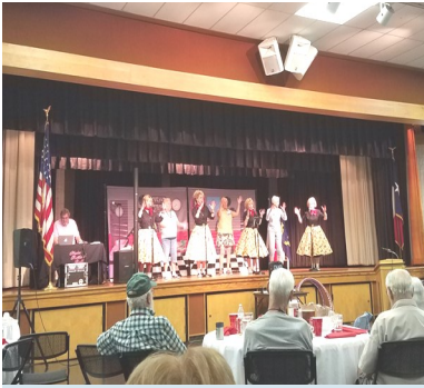
Mineola Shake Rattle and Roll

A big shout out of “THANKS” to those of you who attended our rally at the Mineola Civic Center thusly making the rally a fun filled time for all. You are the ones who make a rally fun and exciting.