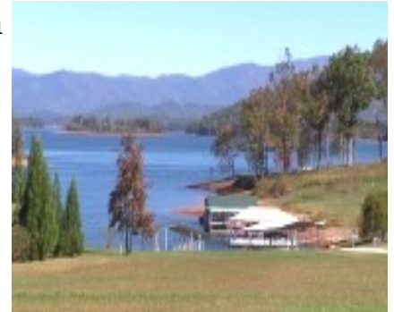
Lake at Hiawassee