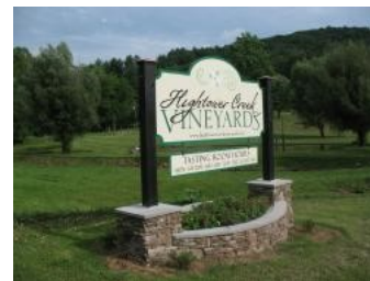
Hightower Creek Vineyards