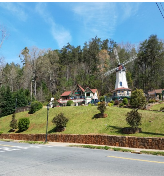
Windmill in Helen