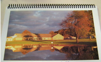
Bashor Children's Home 2009 Celebration of Children's Artwork