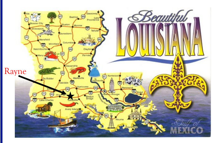
Hope to see y'all there!