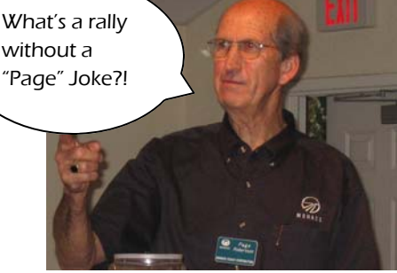
without a "Page" Joke?!

Type "monacoamerica" in the "Search Images" box".