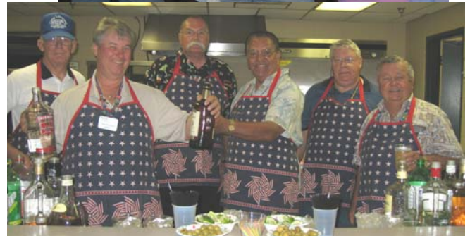
Be nice or see where you get parked!