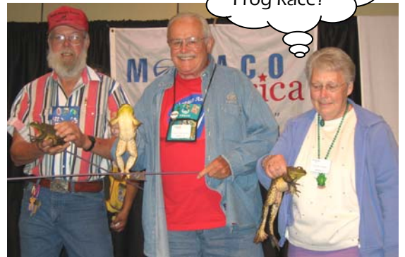
Frogs? Frog Race?

Great friends, food and fun at a Monaco America Rally!