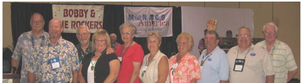
Pictured above is the Board of Directors for the 2007 –2008 Term.