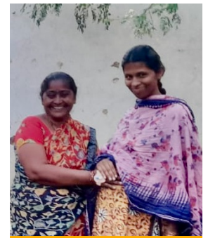
Ritual: mother-in-law blesses her grandchild to-be.

For those who missed the earlier emailed story: We had assumed that we needed to somehow educate the fathers-to-be. But, our village primary health workers and group facilitators informed us that the biggest obstacle to nutrition and health care were the mother-in-laws . Newlyweds come and live with their mother-in-laws till birth of the child. We are now in the process of expanding our program to regularly educate these women regarding nutrition and health care of their in-development grandchildren.