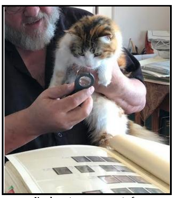
You have to use one eye to focus

Again, EFO's and Varieties make an exciting and educational addition to any stamp collection for they speak to us about how stamps are produced and how sometimes mistakes can be made during the production of stamps.