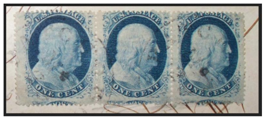
On the #24's, The Patchogue cancel is light but still readable.

The cover clearly has a horizontal strip of 3, U.S. 1857 Scott 1¢ blue #24 type V's. The plate positions of the stamps are currently unknown. The stamps have a light Patchogue N.Y. circular town cancel which tie the stamps at the left. The resolution of whether the strip of stamps is the less common (Va) variety is still to be determined. This should become clear when the plate positions are mapped using Mortimer L. Neinken's "The United States One Cent Stamp of 1851 to 1861." Fortunately, the book is available for free download at: