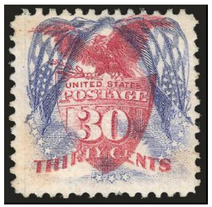
Scott 1869 #121b 30c w/flags inverted.

In the particular case of the Jenny stamps, it is the frame that was inverted and not the vignette.