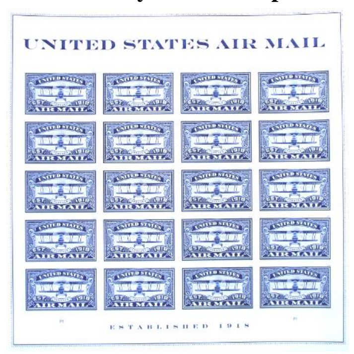
PSA pane of 20

The airmail stamps were released on May 1 in Washington, D.C. to commemorate the 100th anniversary of the beginning of regular airmail service & will be the first of two identical design stamps to be issued this year.