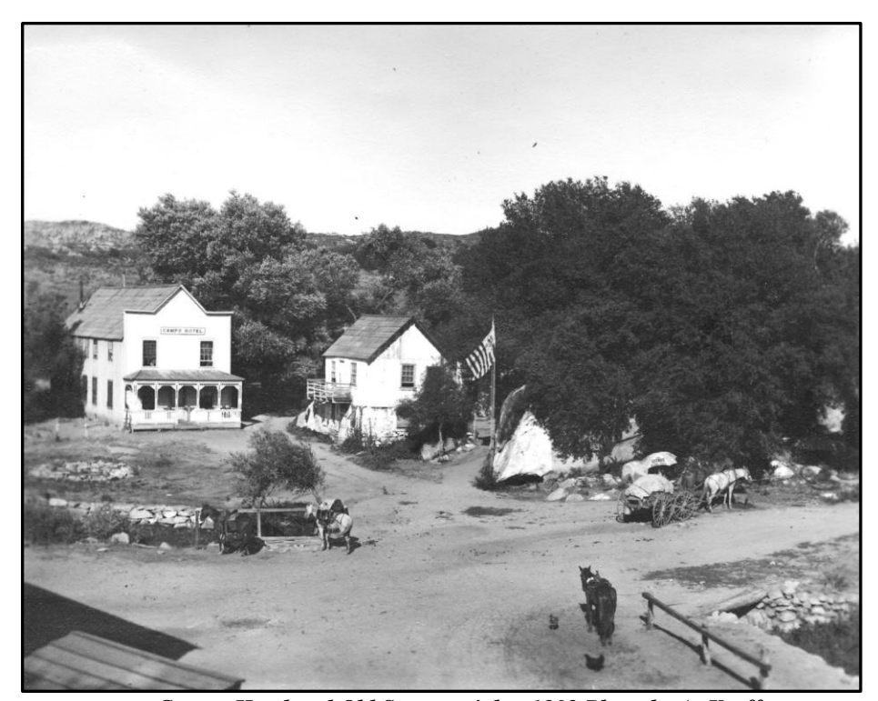
Campo Hotel and Old Store at right c1902