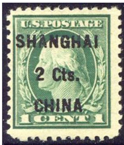
K-1 Shanghai Overprint 2c on 1c Green

Shanghai Overprints - Most U.S. Collectors and specialists are conscious of the Washington-Franklin Shanghai overprints, but few know the story behind these rare and unusual U.S. stamps.