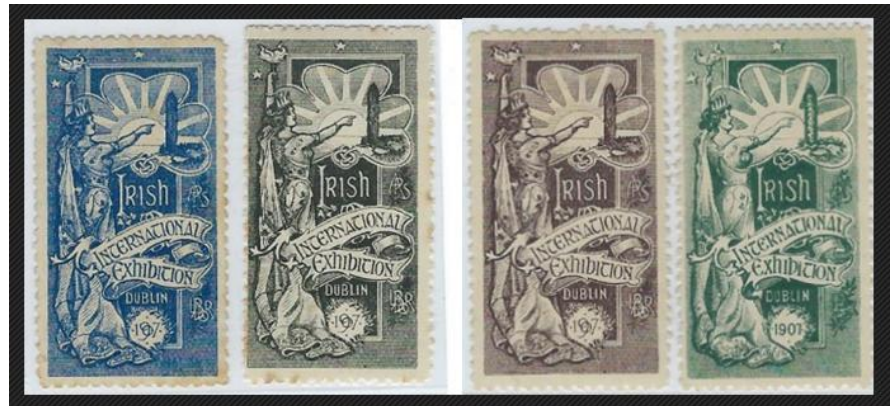
Palomar Mountain, First Day Cover 1948

These official labels were issued in brown, green, blue and black; these labels seem to emphasize a nostalgic view of Ireland, even though the exhibition was promoted in part to show Ireland's manufacturing capabilities.