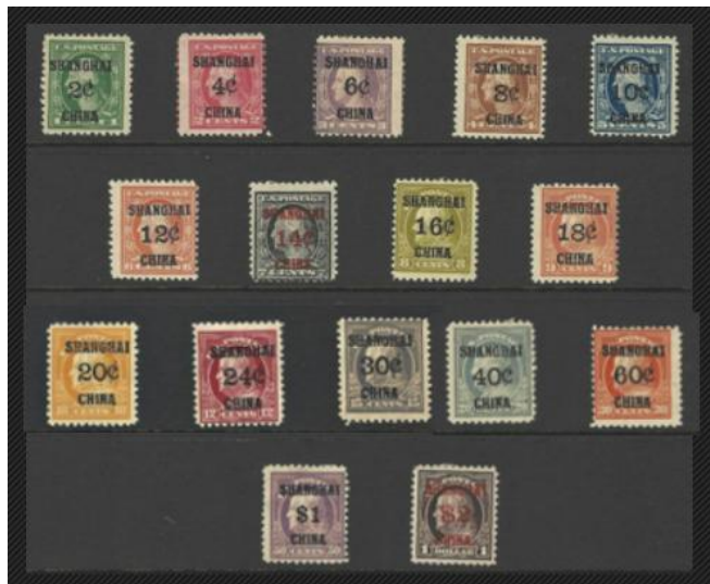
US Scott K1-16 Franklin Shanghai China Overprints

Mint stamp availability far exceeds the genuinely cancelled copies because most mailers in Shanghai were well aware that purchasing the un-surcharged stamps with U.S. currency was a far better value than buying and using the overprints. When issued, there were many collectors who purchased mint copies. A quantity of the surcharged stamps was sent back to Washington in 1922 when the Post Office Department opened the Philatelic Stamp Agency. Subsequently, these unused items were purchased by collectors and survive today as mint items. The postal agency in Shanghai was closed effective December 31, 1922.