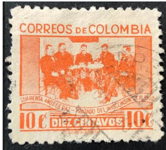
Columbia Scott #495

“40 th Anniversary of the signing of the treaty of Wisconsin”