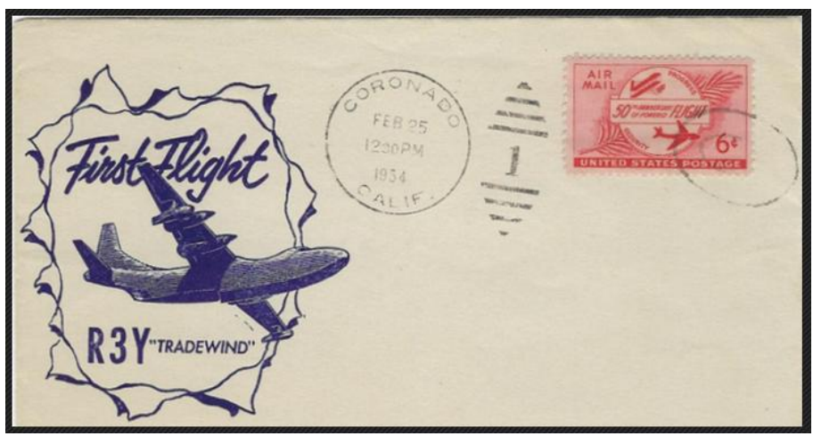
First Flight Coronado Cover

First Flight of the Convair R3Y, "Tradewind", February 25, 1954