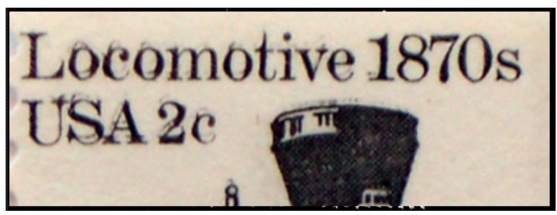
Text and Stack with Doubling