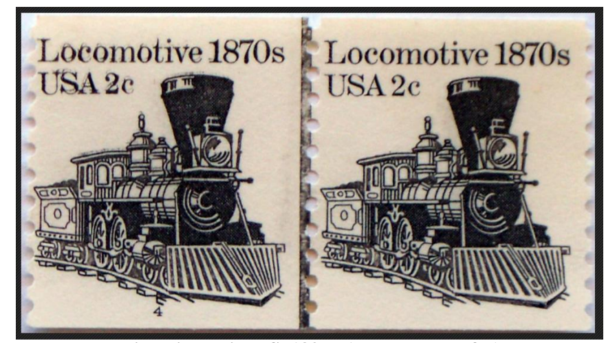
Joint Line Pair U.S. 1897a (Double Transfer)

Recently I found myself sorting loose stamps from some newly acquired collections and noticed some unusual Transportation issue Double Transfers. Much of the doubling was on a Joint Line Pairs of U.S. 1897a's. The Doubling was so clear, that I felt it was necessary to revisit some of the research I had done on similar stamps in the past.