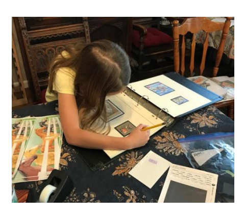
Our Granddaughters' Horses

While Stamp collecting with kids can be an adventure, it can also renew your own interest in stamp collecting. For a child, philately is a superb tool for learning about history, geography, famous people, cultures, and many other things. The things that young learn through people can collecting stamps are manifold and can give your children and grand children an advantage