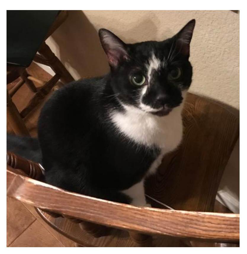
Look who we found at the Grandkids house "First Day Cover Cat" a.k.a. Mjölnir