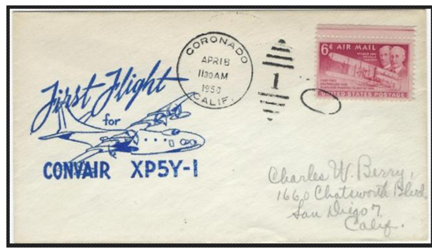
First Flight Coronado Cover

First Flight of the XP5Y-1, from San Diego Bay, April 18, 1950.