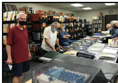
(Club Membership perusing the Consignment Lots)