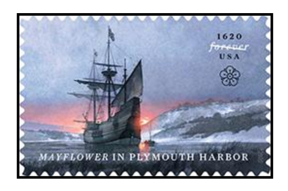
Mayflower in Plymouth Harbor Forever Stamp September 17 | Plymouth, MA | PSA pane of 20

On Dec. 16, 1620, a ship that carried 102 English passengers completed a perilous voyage across the Atlantic Ocean from Plymouth, England, and anchored offshore of today's Plymouth, Mass. The Pilgrims' story is intertwined with the story of the Wampanoag Native Americans, who made an alliance with the Pilgrims and forged a treaty with them that maintained relative peace for more than 50 years. The Pilgrims might not have survived their first year without the help and advice of the Wampanoag, with whom they celebrated their first harvest in the fall of 1621. The stamp also features a stylized hawthorn flower printed in intaglio. In England, the hawthorn, a member of the rose family, is sometimes called a mayflower, as it blooms in May.