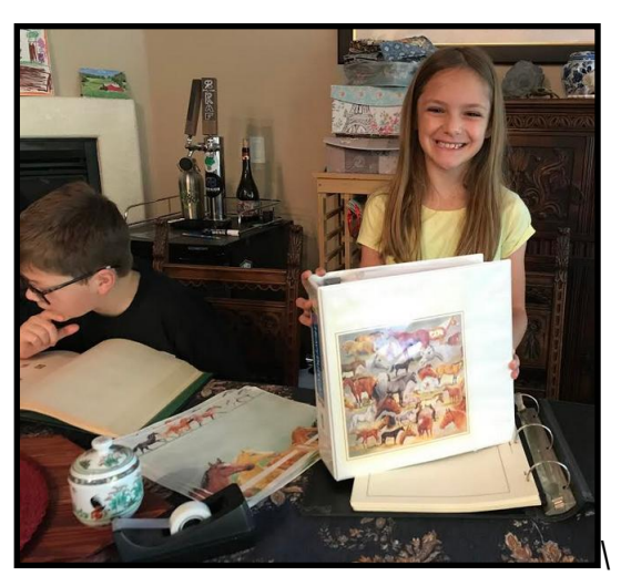
Young Collectors Having Fun

You will find that with most children, and occasionally to your surprise, that they will ask to put more items in their collections in a relatively short time after they have disengaged. Importantly, never show frustration of discouragement. You can even utilize one of the methods my grandfather used with me; first he would write me a letter asking what stamps I needed for my album, he never limited which stamps I could ask for. I can remember several times asking for stamps on page one of my Scott U.S. Collection. It soon became apparent that Grandpa was fresh out of those U.S. Scott #1 and #2 duplicates. He was careful to send me stamps that if damaged or lost, would not be considered wasteful or irresponsible. With time you too will be able to better judge your readiness to give better specimens to a young collector. Besides if you get your new collector to write a letter back, then you will have already had great success.