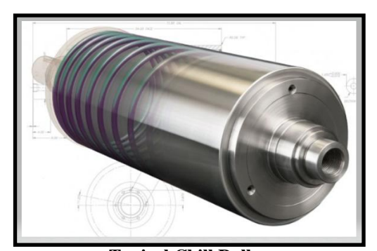
Typical Chill Roller

"Chill roller Doubling is a term many collectors became familiar with during the 1980's as a result of doubling found on several stamps of the popular Transportation coil series. Chill rollers are special rollers on some presses to help cool the web after the stamps have been printed, often to prepare the web for another step, such as tagging. These chill rollers occasionally pick up ink from the printed stamps and deposit on the others, creating what collectors refer to as a chill roller doubling."