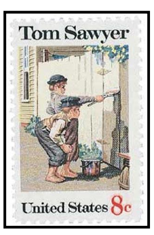
U.S. #1470 8¢ Tom Sawyer Typical Printing

For color shifts however, even the smallest shift of a plate or cylinder will give the stamps the impression of being blurred or doubled. The key to their identification is the color shifts. The 8¢ Tom Sawyer stamp of 1972, Scott 1470, provides multiple examples of this specific shifting problem.