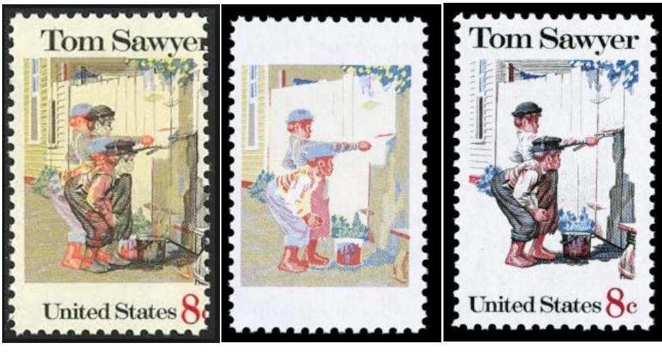
Figure 1: Color Shift (Freak)

Figure 2: Color Missing (Error Red/Black) $1450