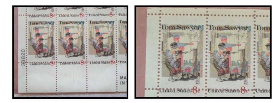
Full Sheet of Black and Red Color shift

Everyone who finds an error, freak or oddity wonders about its monetary value. The value of any EFO is usually tied to its scarcity. The values of freaks and oddities are generally less than most common errors. Collectors are often drawn to varieties that show any dramatic or unusual change in the stamps design, and the attractiveness of a freak may increase its value.