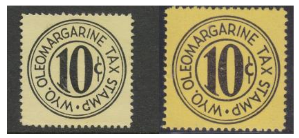
Litchfield 861 10c Oleomargarine Tax Litchfield 862 10c-Oleomargarine tax Sold for $26.00 Sold for $24.50