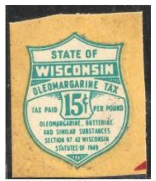
Litchfield 841 1949 Oleomargarine 15¢