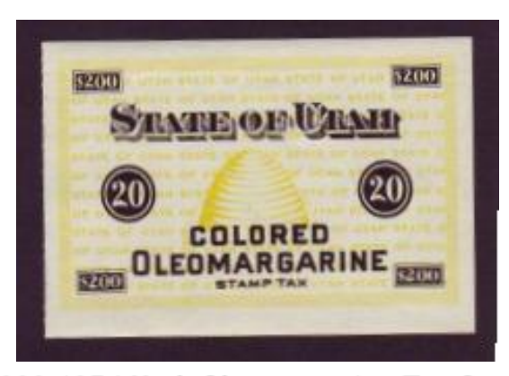
Litchfield 822 1954 Utah Oleomargarine Tax Stamp $2.00 20 pounds UTAH