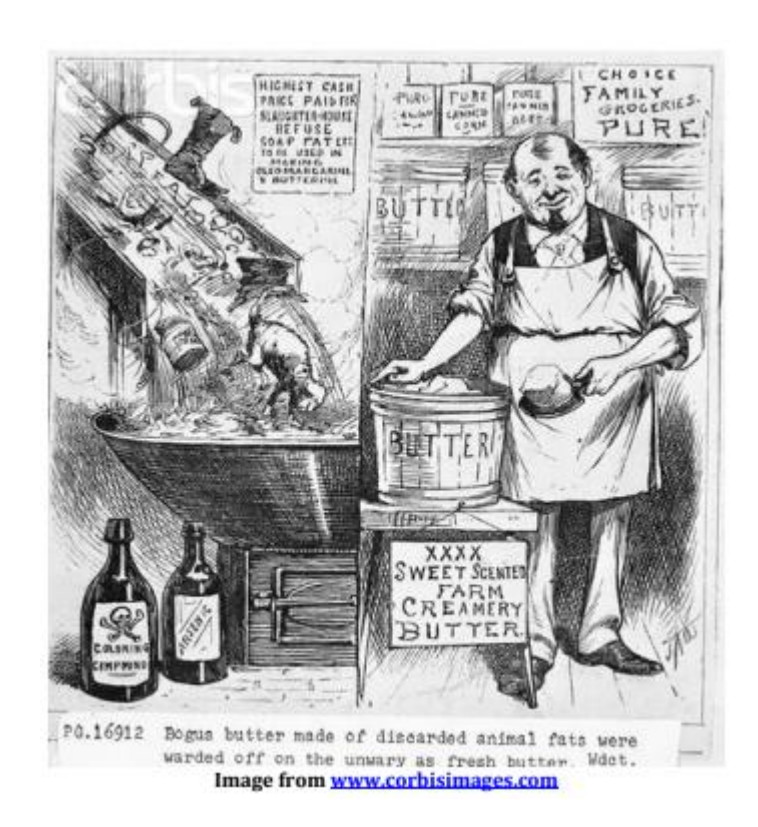
Cartoon on how Oleomargarine was viewed (most likely paid for by the butter industries and dairy farmers.