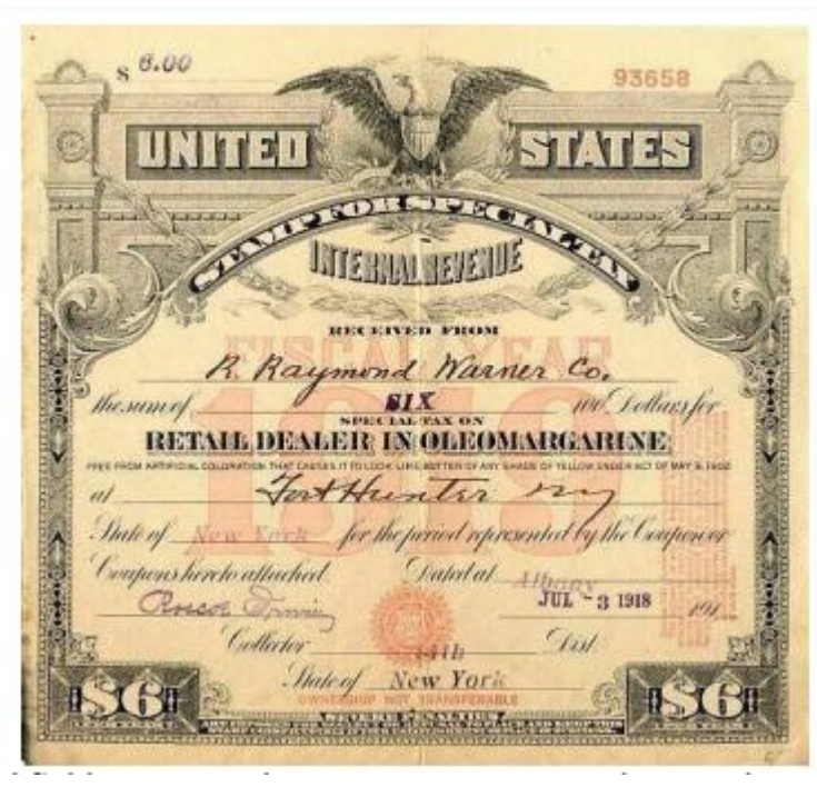
Litchfield #217 1919 (Design B, 187 x 171 mm (1915-20) Imperf)