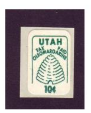
Litchfield 831 bright green/olive green Die Cut