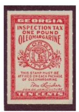
Litchfield 611 1935 Oleomargarine 10c