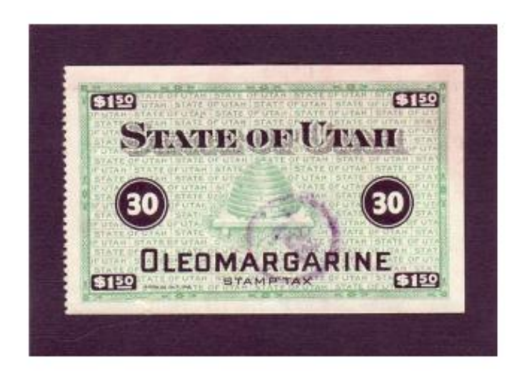
Litchfield 817 Utah Oleomargarine Tax Stamp $1.50 30 pounds