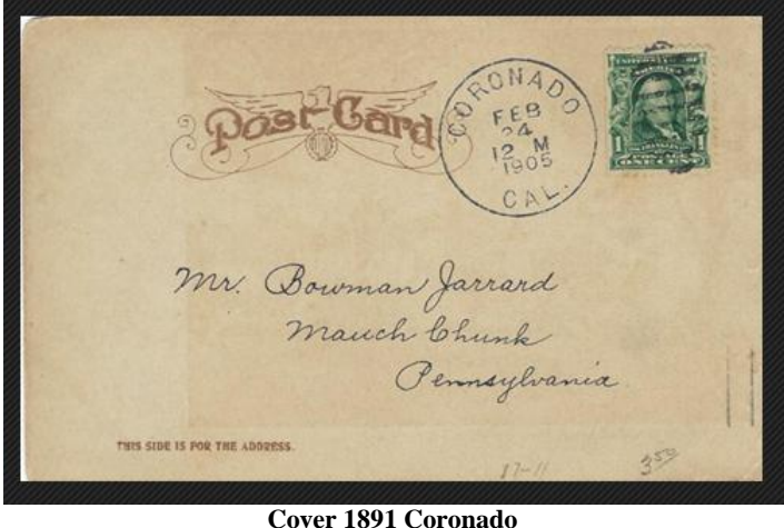
Cover 1891 Coronado

A United States post office was established on February 8, 1887. This 2 cent printed envelope (thanks to David Klauber) shows a cancellation date of Sept 30, 1891.