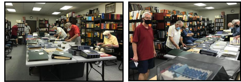
(Club Membership perusing the Consignment Lots)

Consignment Update – The PSC Consignment Sale held on Saturday September 12<sup>th</sup>, was very successful. Over $3500 was received on purchases of Philatelic items. Thank you to all of our members who supported this effort. The families' consigners visited the sale and were very pleased to see our membership taking joy in their Mother and Grandmothers collections. You have made the family very happy, congratulations!