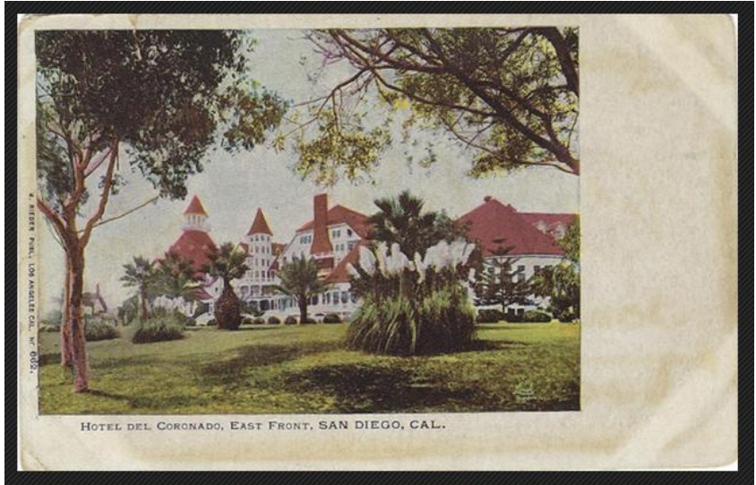
Post Card East Side Hotel Del

The post card rate of 1 cent of February 24, 1905, on an undivided back post card; the reverse of the card shows the East front of the Hotel (the card was published by M. Rieder, Los Angeles, CA)