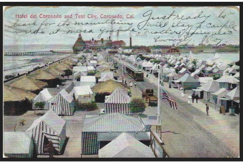
Post Card Tent City Coronado

The second picture postcard shows the once ever popular Tent City, which thrived for many years as a popular vacation destination, just to the south of the Hotel Del Coronado (this card was published by Newman Post Card Co.