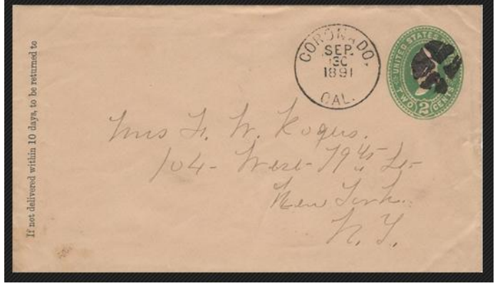
Cover 1891 Coronado

The town of Coronado was named after the islands off the coast with the same name. Those islands were sighted by Vizcaino, under the flag of Spain, in 1602. In 1846. Governor Pio Pico gave a 4000 acres land grant to Pedro Carrillo, which included Coronado and North Island. In 1886 the Coronado Beach company was formed, and a resort hotel was planned, which resulted in the world famous Hotel Del Coronado.