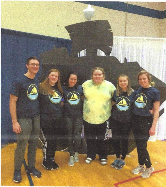
The special events chair and captains at the end of 24 FAC.