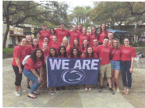
ASB in San Antonio, Texas