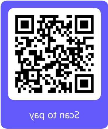
Hole Sponsorship Fee