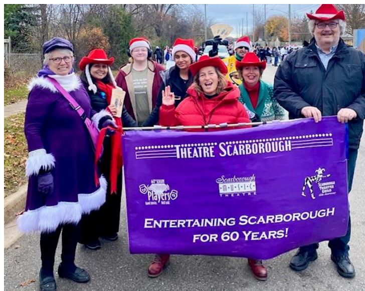
Photo: Pickering Santa Claus Parade November 23,2025