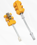
4 and 8 position Modular Adapters