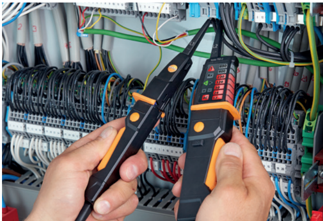
Measuring voltage in a switching cabinet.

Complies with latest voltage tester standard