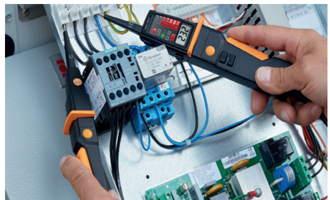
The testo 750-3 voltage tester features an all-round LED display, a deep-set anti-slip ring and an ergonomically shaped handle designed for convenient use.