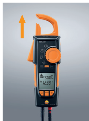
Easy handling with tightly laid cables.