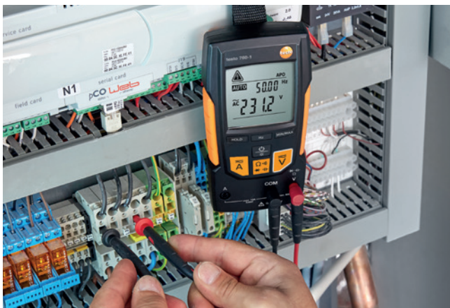
Testing voltage in the switching box of a heat pump.