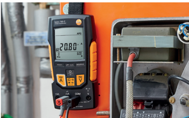
Thanks to automatic measurement parameter recognition, the digital multimeter testo 760-2 offers ultimate reliability for all applications.