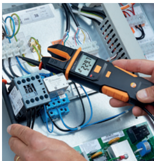
Measuring voltage on a compressor.