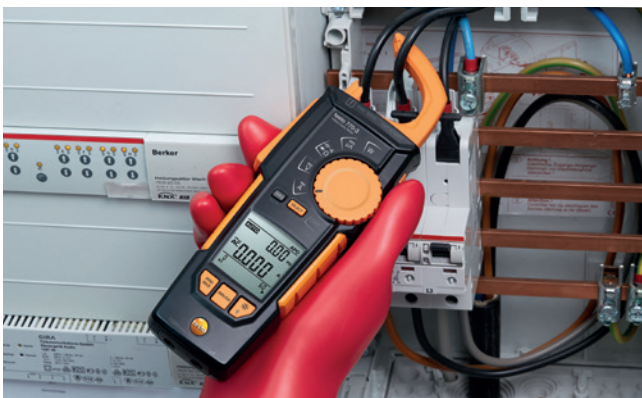
Non-contact measurement on tightly packed cables is really easy and reliable with the testo 770-3 clamp meter: one retractable pincer arm can be fully retracted.