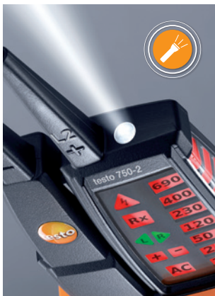
Convenient illumination of measuring points.