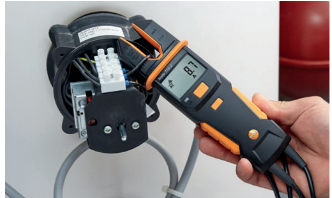
It features automatic measurement parameter recognition, exchangeable measuring tips and a voltage range up to 1000 V.