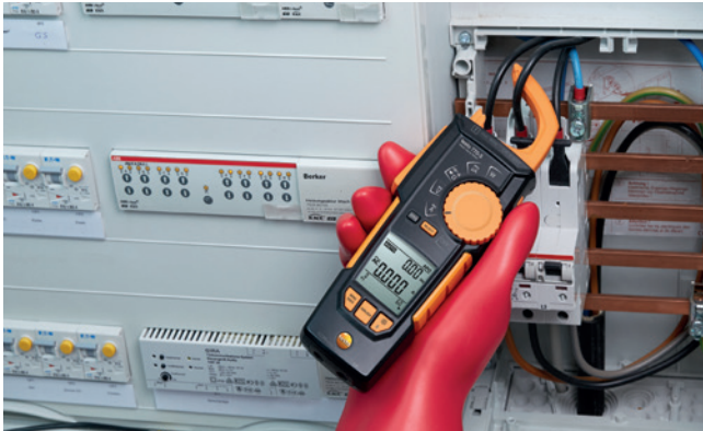
Voltage tester and current measuring instrument in one: testo 755-2 is an all-rounder for almost all electrical measuring tasks.

Digital multimeters with automatic measurement parameter recognition, clamp meters with a unique grab mechanism or voltage testers that also measure current – this is what electrical measuring technology in Testo quality is all about.