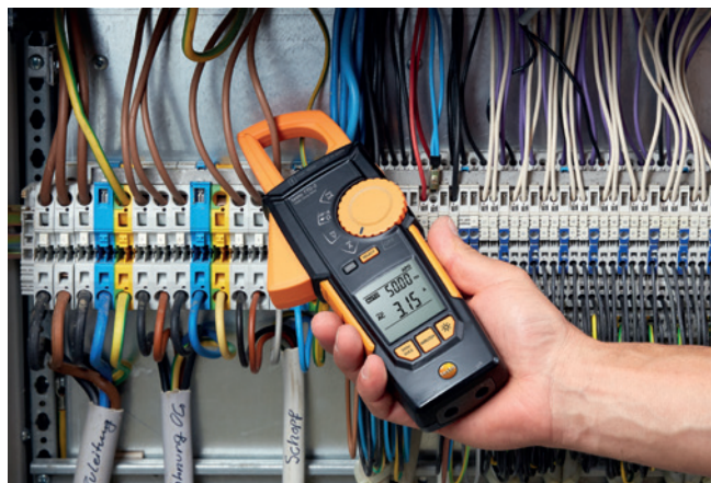
Measuring current in a switching cabinet.