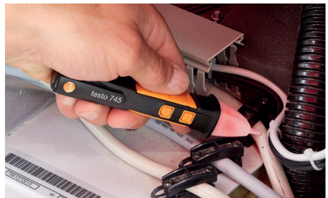
The waterproof and dustproof testo 745 voltage tester is a robust and hard-wearing instrument to help you with your everyday work.