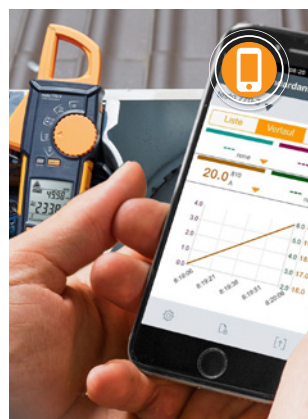
Convenient display and documentation of the measurement results using the Smart Probes App.