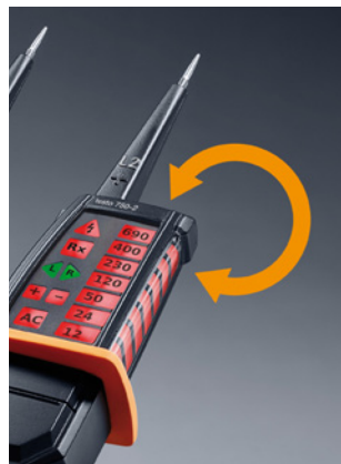
The testo 750 voltage tester features an all-round LED display.