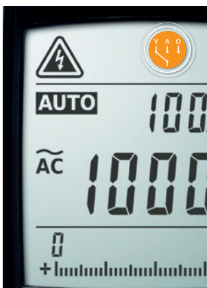
Automatic measurement parameter detection