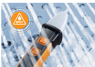
Waterproof and dustproof according to IP 67.

The non-contact voltage tester with a measuring range of up to 1000 V is particularly well-suited to fast initial checking of any suspected fault sources. When AC voltage is detected, the testo 745 gives a clear visual and audible warning. In order to increase the reliability, the voltage tester has a filter for high-frequency interference.