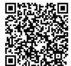
Donation QR code