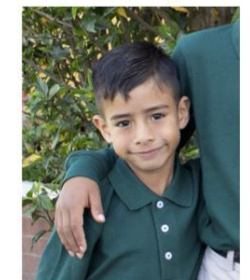
Rosbibelex age 6