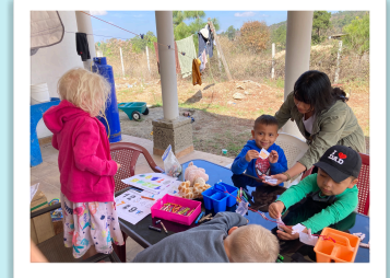
Bilingual activity time at the McCauley's house