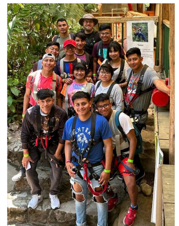
All the young adults in our ADVANCE program on a spiritual growth retreat at Lake Atitlan