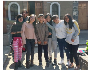
Teenagers from Casa de Mi Padre attending an Easter break retreat