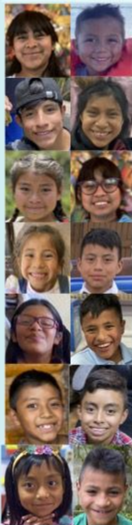
2nd Generation of Casa de mi Padre

So as far as what we believe... well, we believe these are promptings that God has brought us to desire for our children as we have loved them and constantly cried out to God for the direction of them and the ministry overall.