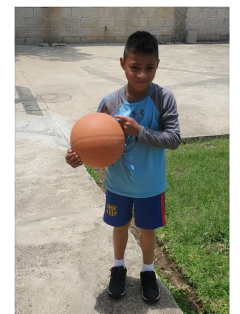
Life at Casa de Mi Padre