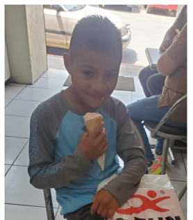
Out on the town