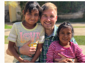
We work to provide a loving, family environment in our orphanage.

The ministry of Child Rescue is to provide refuge and shelter for needy children coming from poverty, shattered homes, abandonment, or children orphaned through death. Child Rescue meets the physical needs of children in order to have the opportunity to then meet their spiritual needs. We usually have about 23 kids ages 5-17 living in our orphanage.