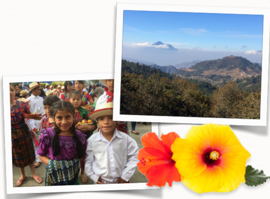
Top: Mountains and volcanoes of Guatemala. Bottom: Two of our kids in traditional attire.

Our orphanage is located in Santa Cruz del Quiché, Guatemala, Central America. Although the country of Guatemala is ecologically beautiful, poverty is particularly wide spread throughout the countryside and large intercity areas. Illiteracy, infant mortality, and malnutrition are among the highest in the region, while life expectancy is the lowest. The Quiché people are an indigenous group who have limited education and resources. The population of the city of Santa Cruz is between 45 and 55 thousand people. The opportunity for ministry is vast and the need for orphan care in Santa Cruz, the district of Quiché, and the surrounding region is real.