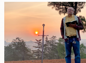
Proclaiming the glory of God is our highest goal.

We seek to glorify God by sharing His love with others in word and deed. Kids from Casa participate in our weekly Bible quizzing program along with other youth in the area, as well as camps and retreats. We also host missions groups from the USA for mission trips to serve at the orphanage or to help with the construction of our new orphanage site. More details are on the our website.