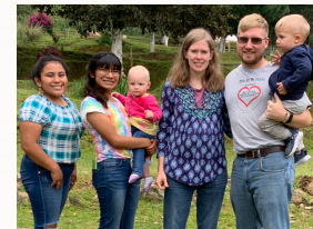
We've had older kids from Casa live with us if we can't find Guatemalan homes.

When the young people we serve turn 18 and have to leave the children's home, our ministry continues helping them as they journey toward independence. This program is serving 10 young men and women. We currently have 2 of these students living with our family, and expect for another to move in soon.