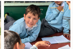
We make sure each of our kids has quality schooling.