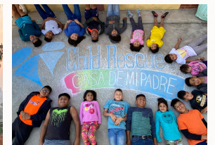
We pray that our kids will follow Christ and live for Him.