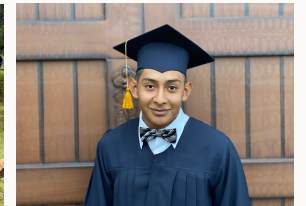
We continue to fund our kids' education after age 18 when they must leave Casa.