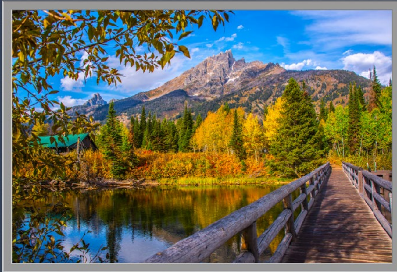
Gallery Giclee Fine Art Prints With Digital Matting