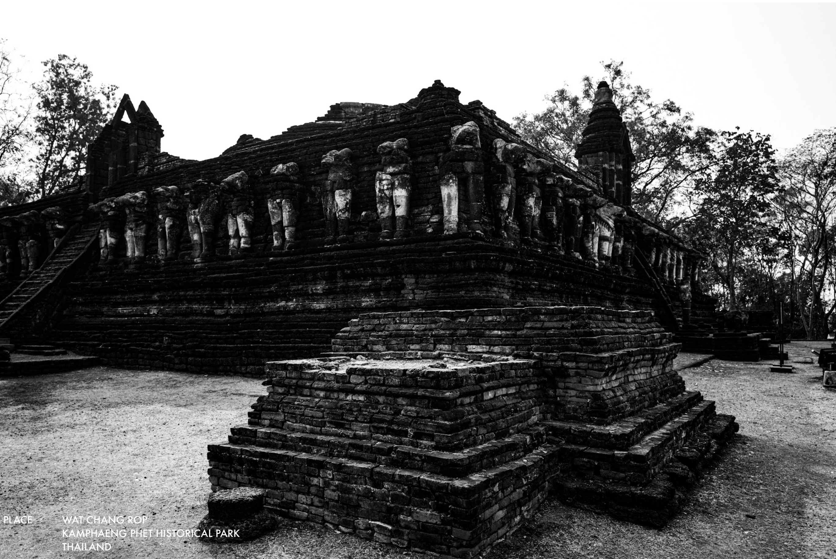
PLACE WAT CHANG ROP KAMPHAENG PHET HISTORICAL PARK THAILAND