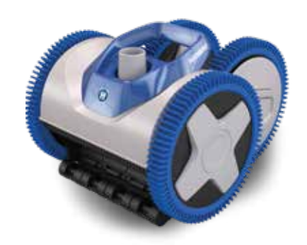
AQUANAUT 450 More wheels to cover even more ground.