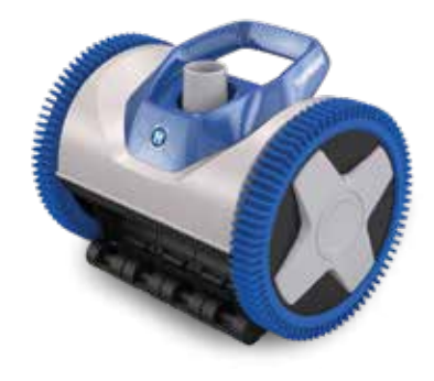
AQUANAUT 250 Everything you need and nothing you don't.

Featuring patented V-Flex® technology and exclusive 4-wheel drive capability, AquaNaut® suction cleaners are the first of their kind to clean corner to corner without clogging or getting stuck. They expertly navigate any surface while maintaining optimal suction, even when encountering tough obstacles and large debris. Plus, with two dependable options, there's a perfect solution for every pool.