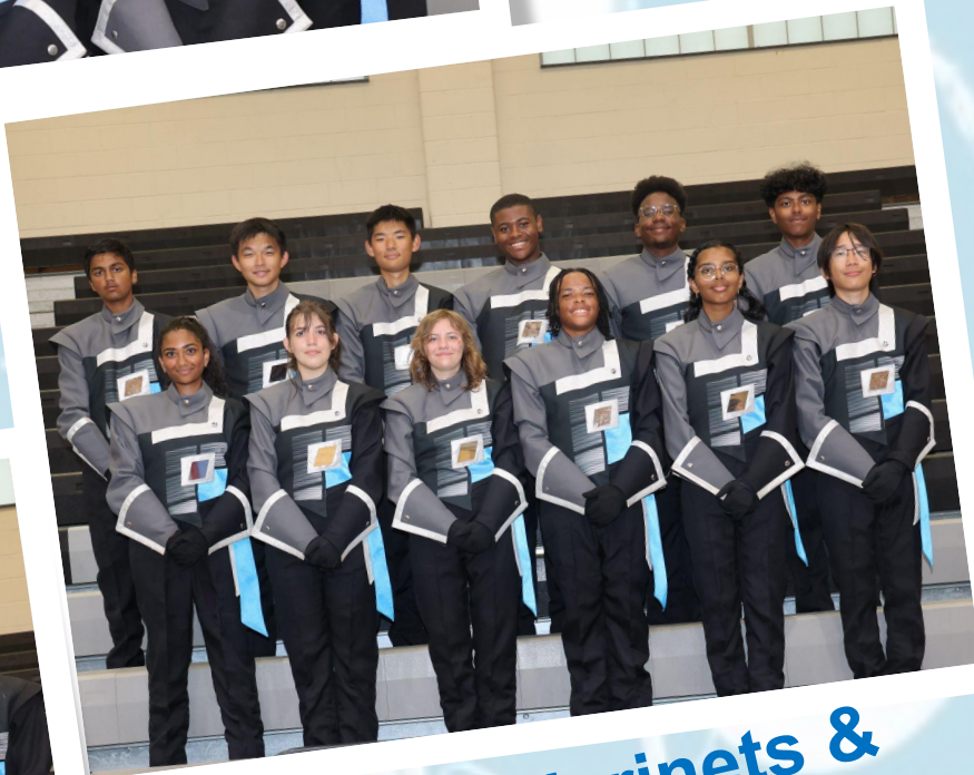
Bass Clarinets & Saxes