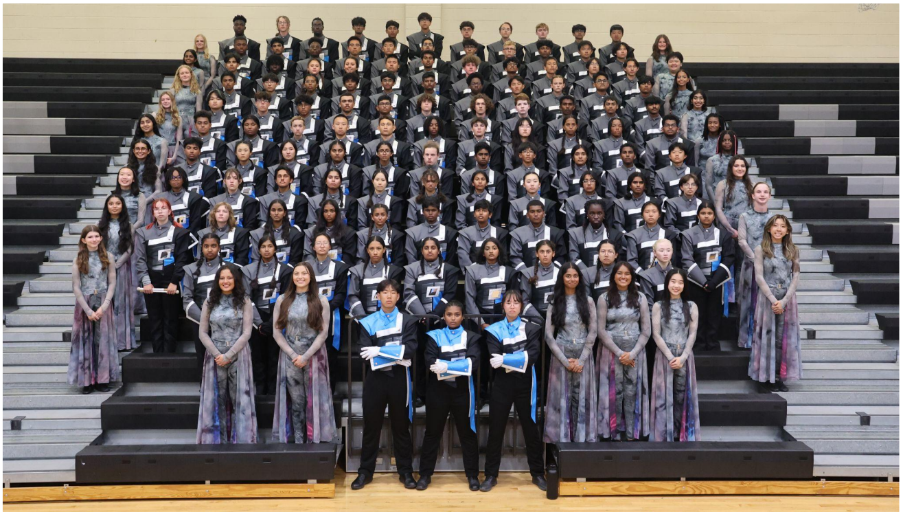
PCHS Marching Band 2024-25