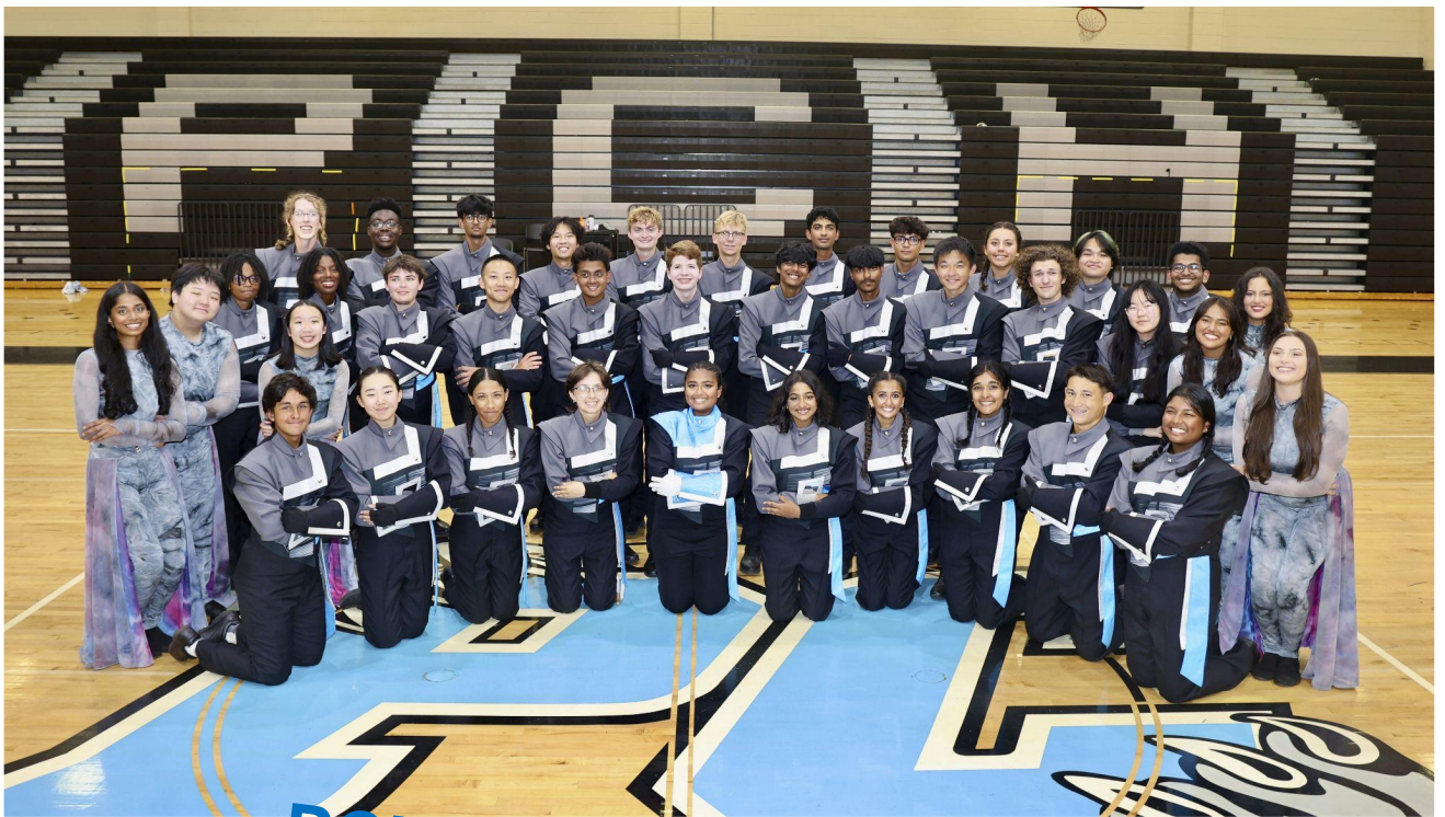
PCHS Band Senior Class of 2025!