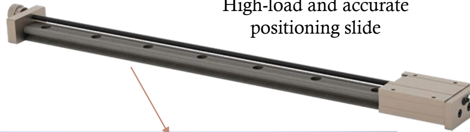
High-load and accurate positioning slide