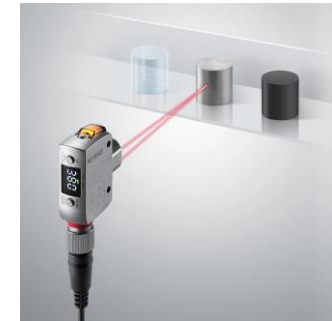
Keyence laser sensor