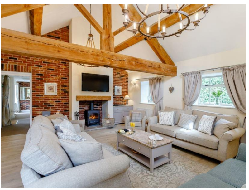
Lounge and log fire