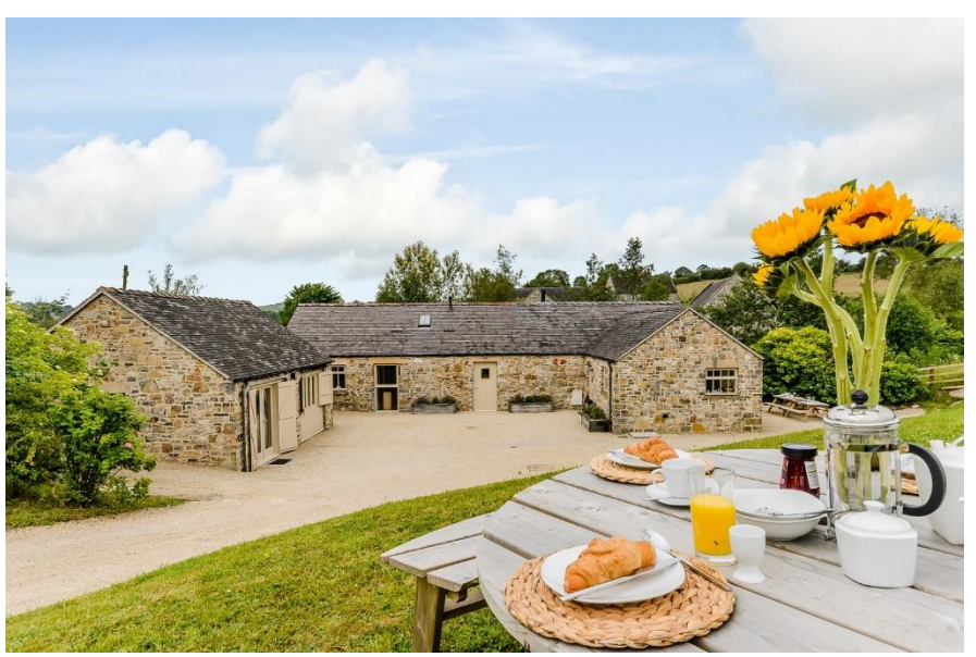
Parking space adjacent to the property