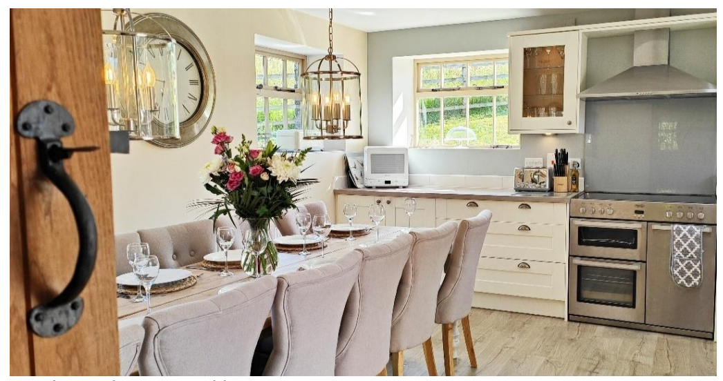
Kitchen and Dining Table