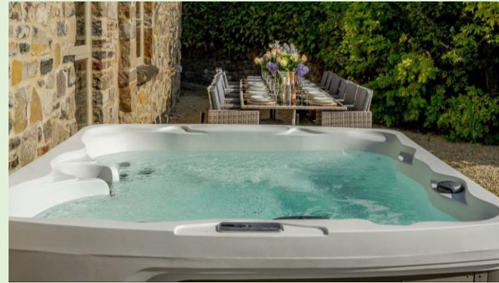
The bubbles in the hot tub