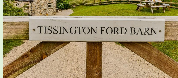
Tissington Ford Barn's Sign