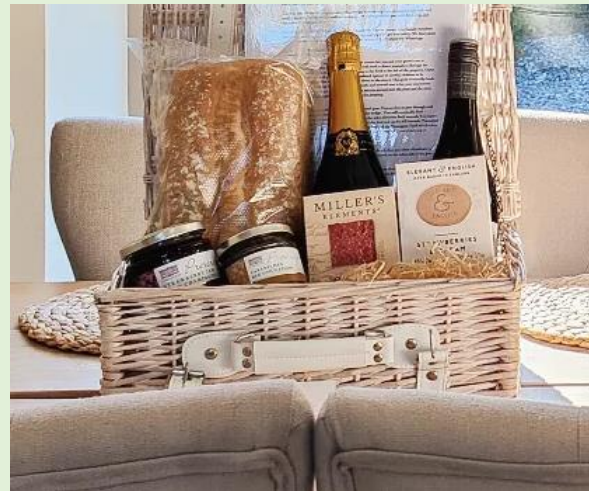
The biscuits, crackers, jam, chutney and bread in the welcome pack