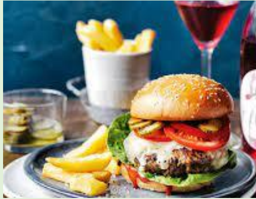
The food we cook throughout our stay