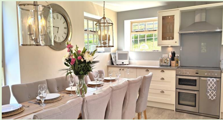
The kitchen with comfy chairs