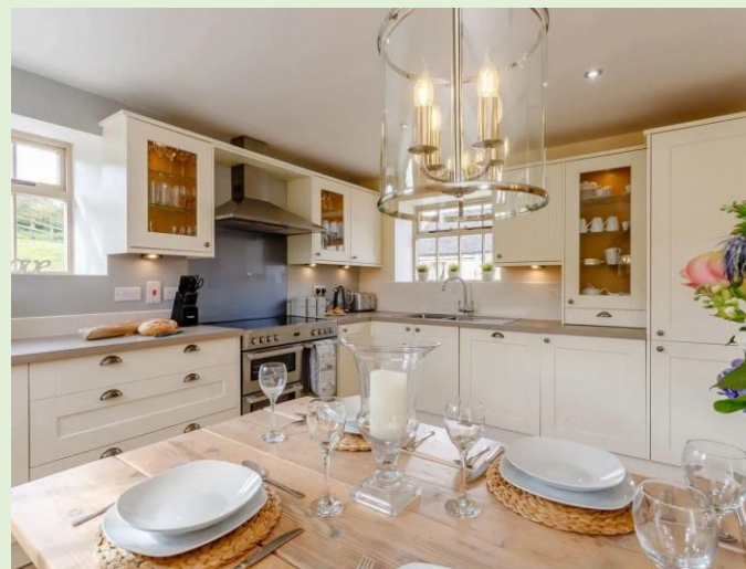
The wooden kitchen table and worktops