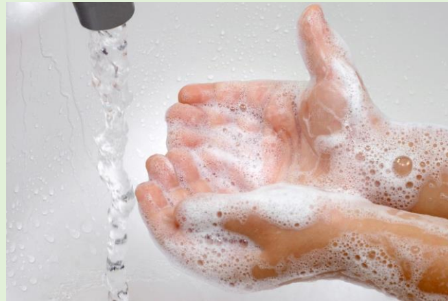
The soap in the bathrooms