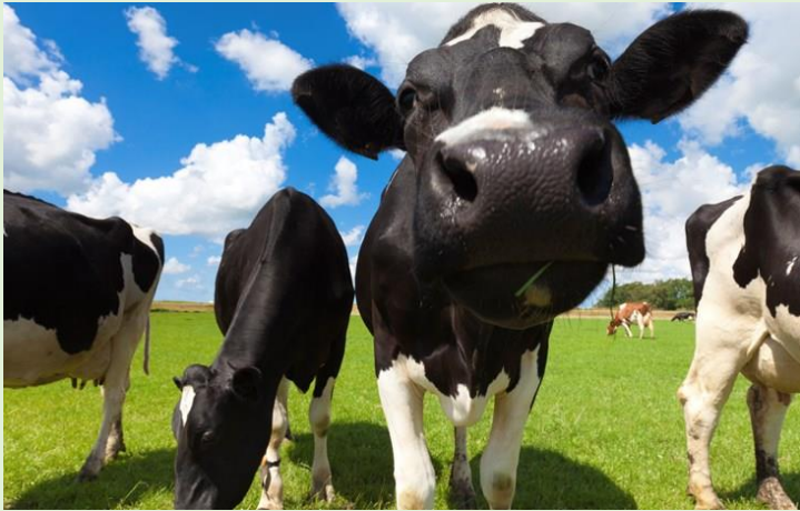
The cows in the fields nearby