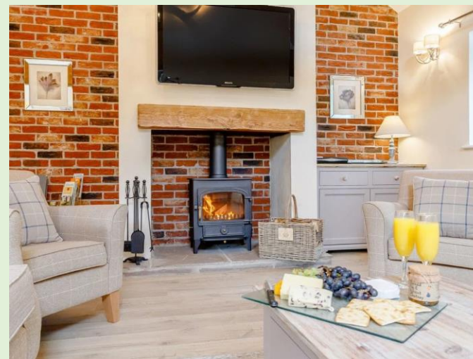
The TV & the crackling of the fire