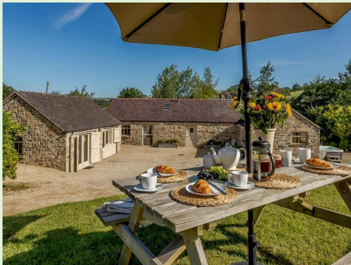
Tissington Ford Barn's stone walls and wooden picnic table