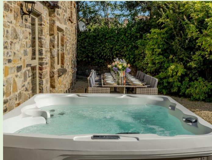
The smell of the chlorine in the Hot tub