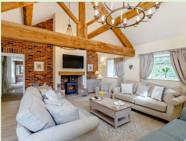
The lounge with sofas and log burner