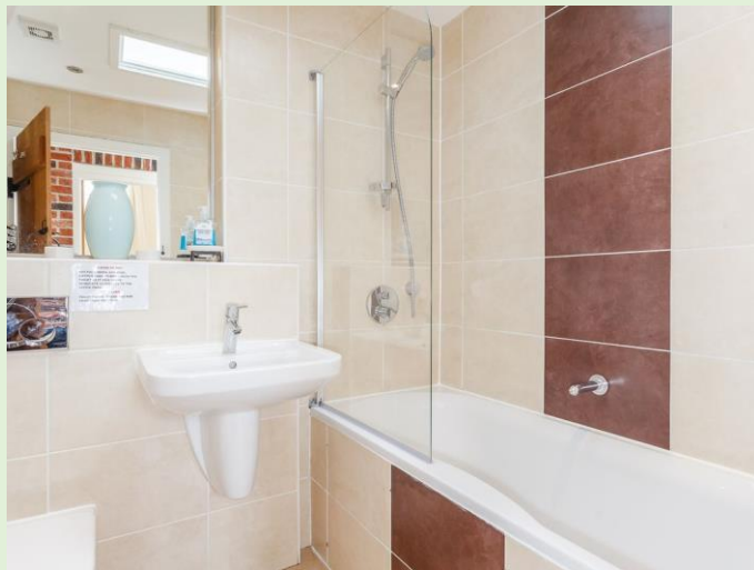
The warmth from the bath/ shower