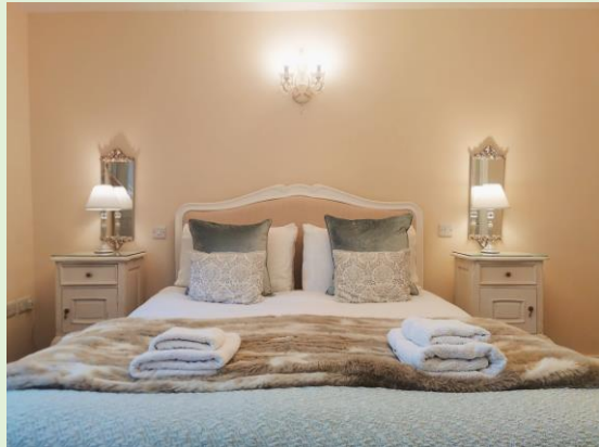
The soft fluffy blankets