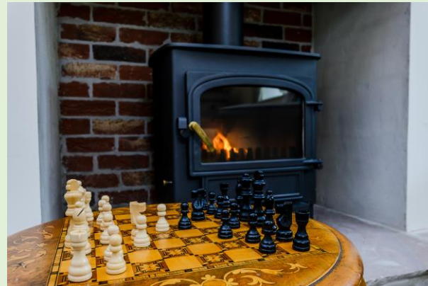
The warmth of the fire