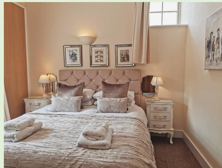
The cosy bedrooms