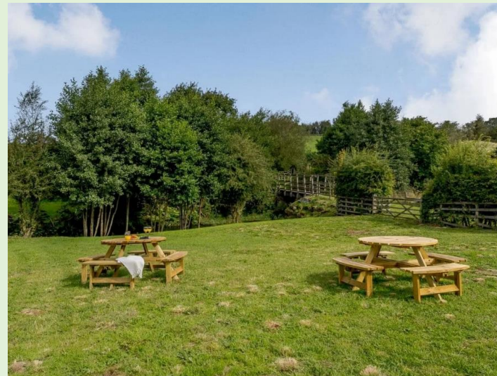
Tissington Ford Barn's picnic area and trees