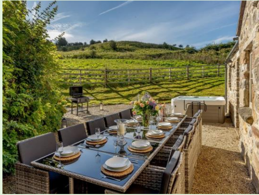
The Hot Tub and Outside Dining Table