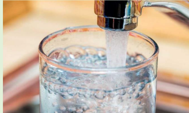
The water from the tap