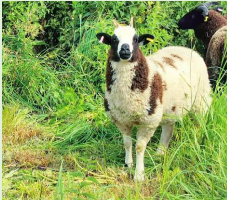
The sheep in the fields