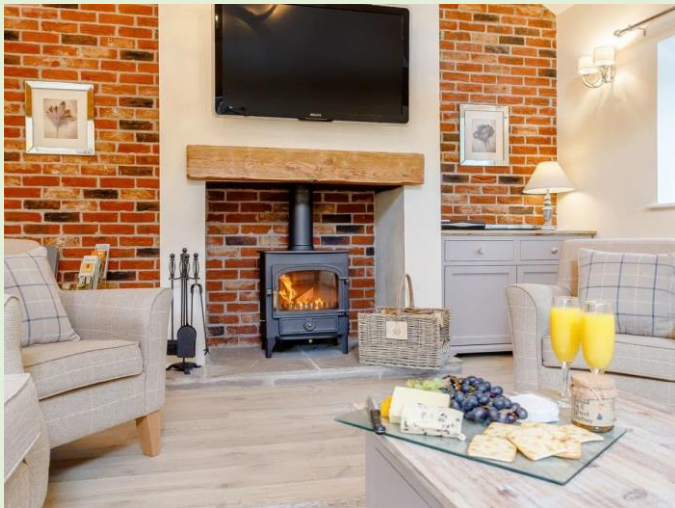
The smell of the logs burning