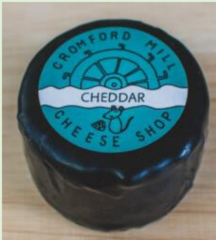
The milk in the fridge and local cheese