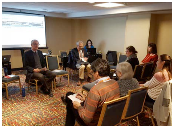
SSS Business Meeting