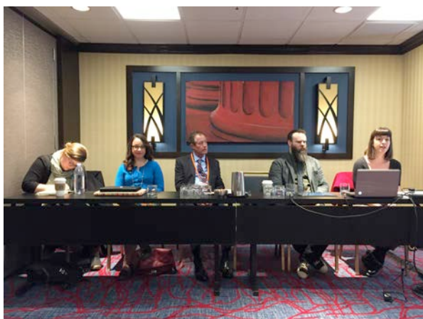
The SSS Young Scholars Panel at the 2018 ASEES Convention.