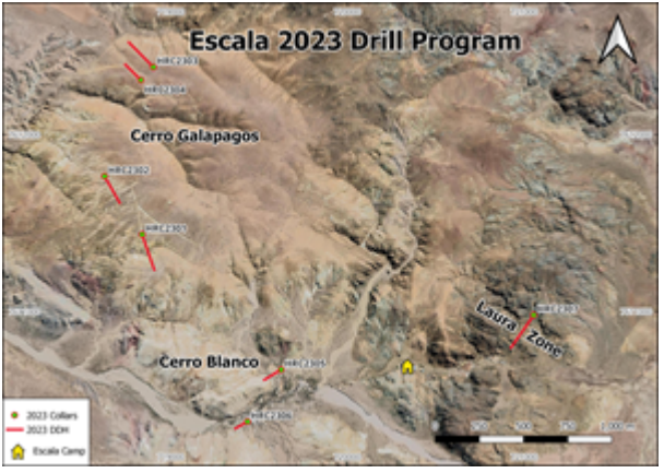
Drill Plan Map